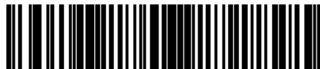
I 2 of 5 - Any Length