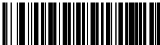
*Enable Interleaved 2 of 5